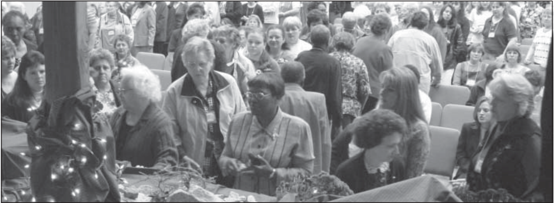
Women "connect to the vine" as they lay their crushed roses at the feet of Mt. Calvary.