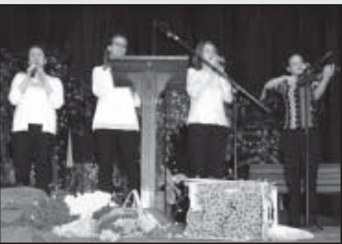
A special musical concert and praise ensembles were presented throughout the weekend by MESSAGE OF MERCY, a popular musical team at women's retreats and churches. They have worked together for several years in and around the Collegedale, TN area. They truly filled the hearts of those who attended with worshipful music and praise for our Saviour and Lord.