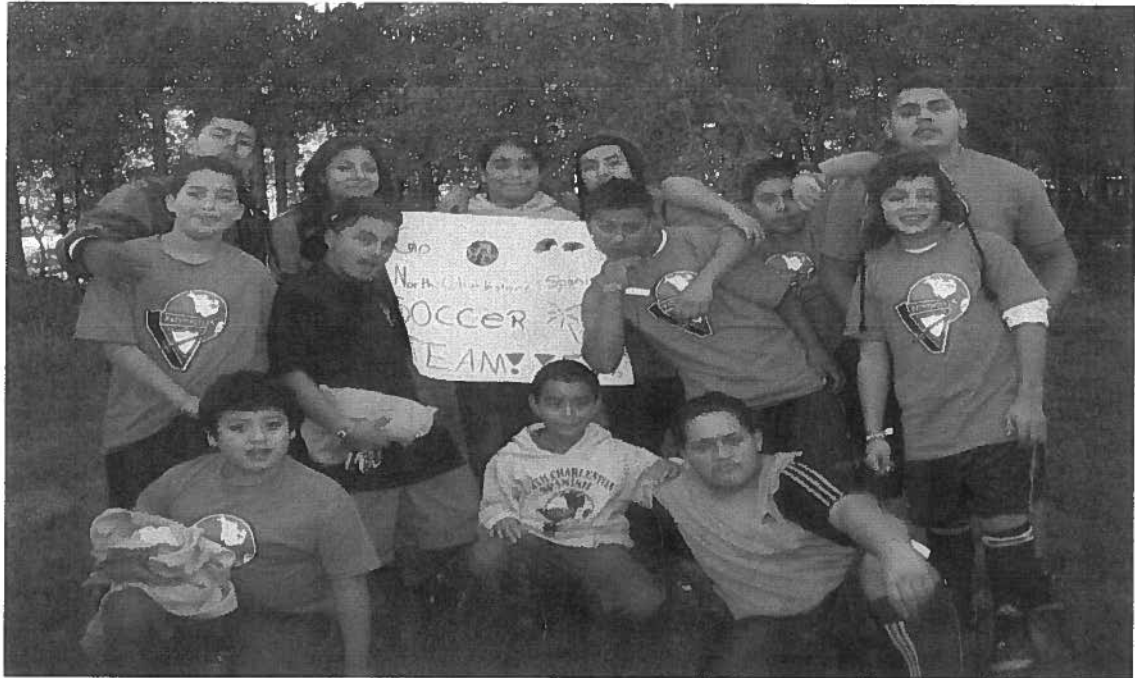
North Charleston Spanish