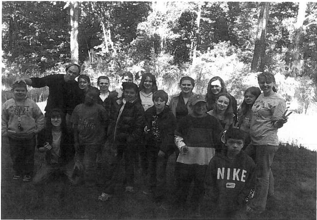
West Columbia Warriors